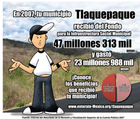
Figure 1: Example of Flyer

Notes: The flyer was folded in half. The upper image is the front and back of the flyer, the lower image is the inside of the flyer.